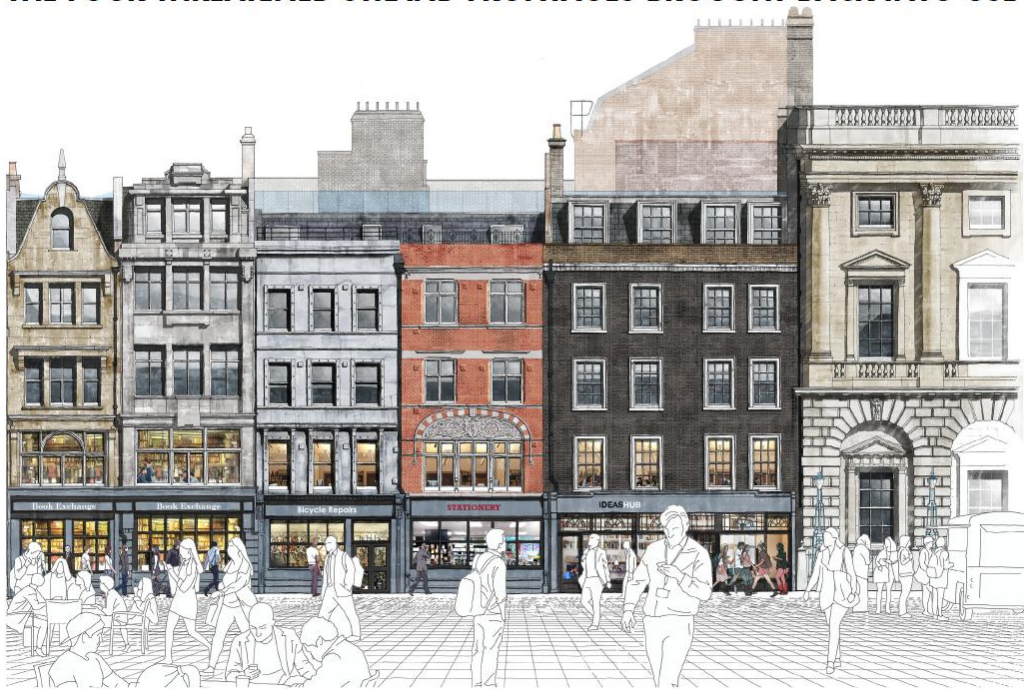
At present the shopfronts are boarded up. The narrow plots provide the perfect foil to the monumentality of Somerset House on the right. The narrow slip of glass visible above the parapets is the top of a glass atrium proposed for the back of the buildings to connect them to each other and to the Brutalist building.